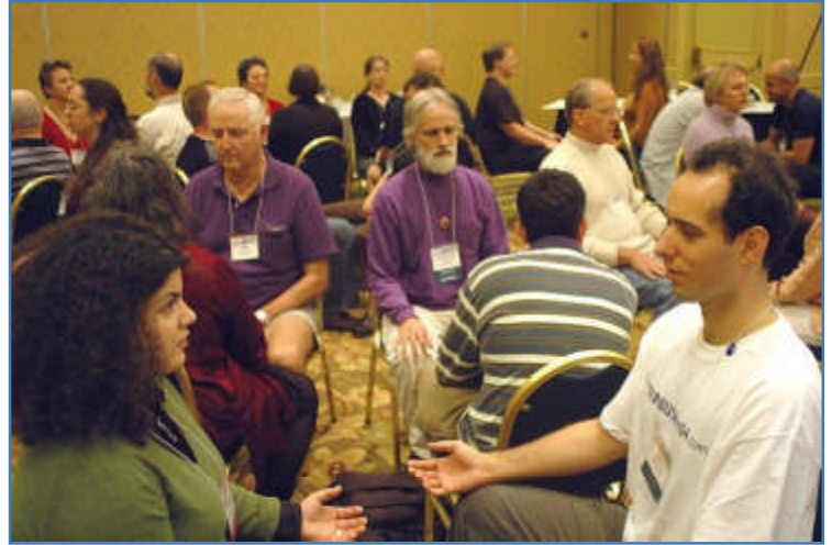
Enjoy great workshops and educational sessions!